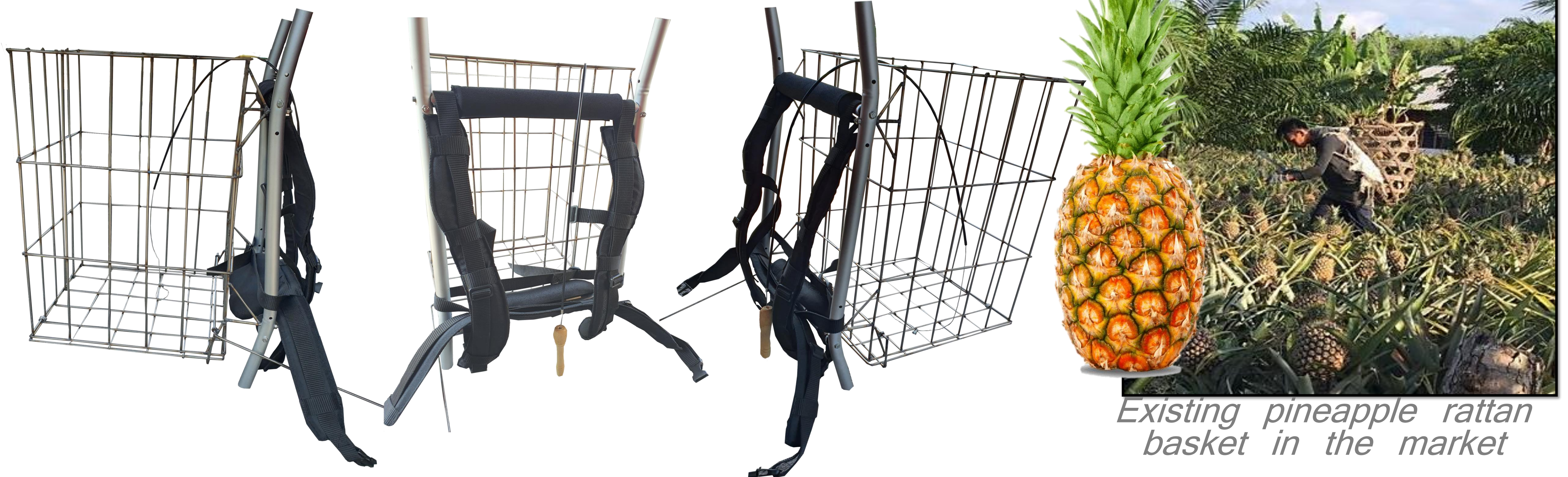
Existing pineapple rattan basket in the market

Alternate views of SumoSack stainless steel harvesting basket for manual harvesting work