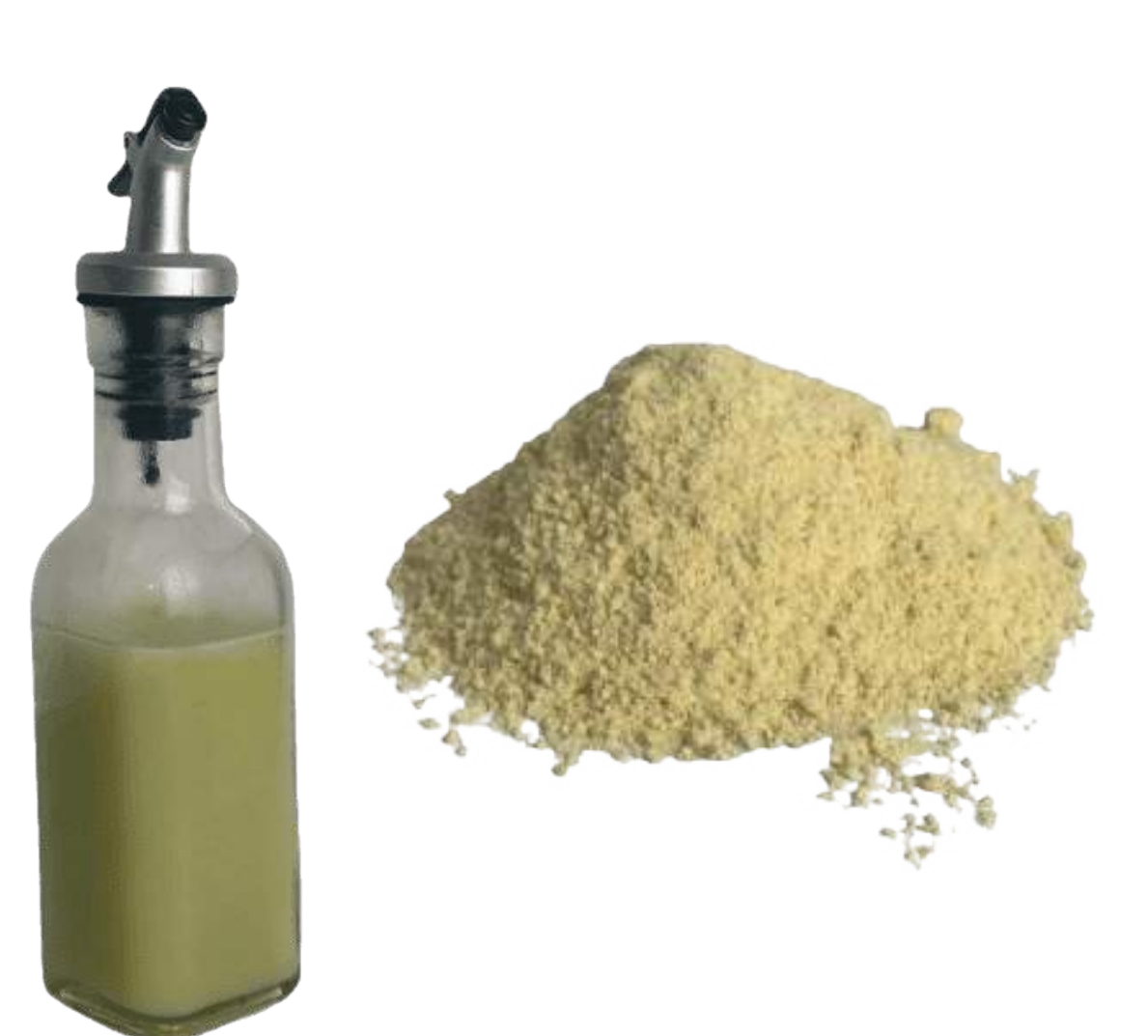
THE SUPERIORITY OF PRODUCTS COMPARED TO THE COMPETITORS